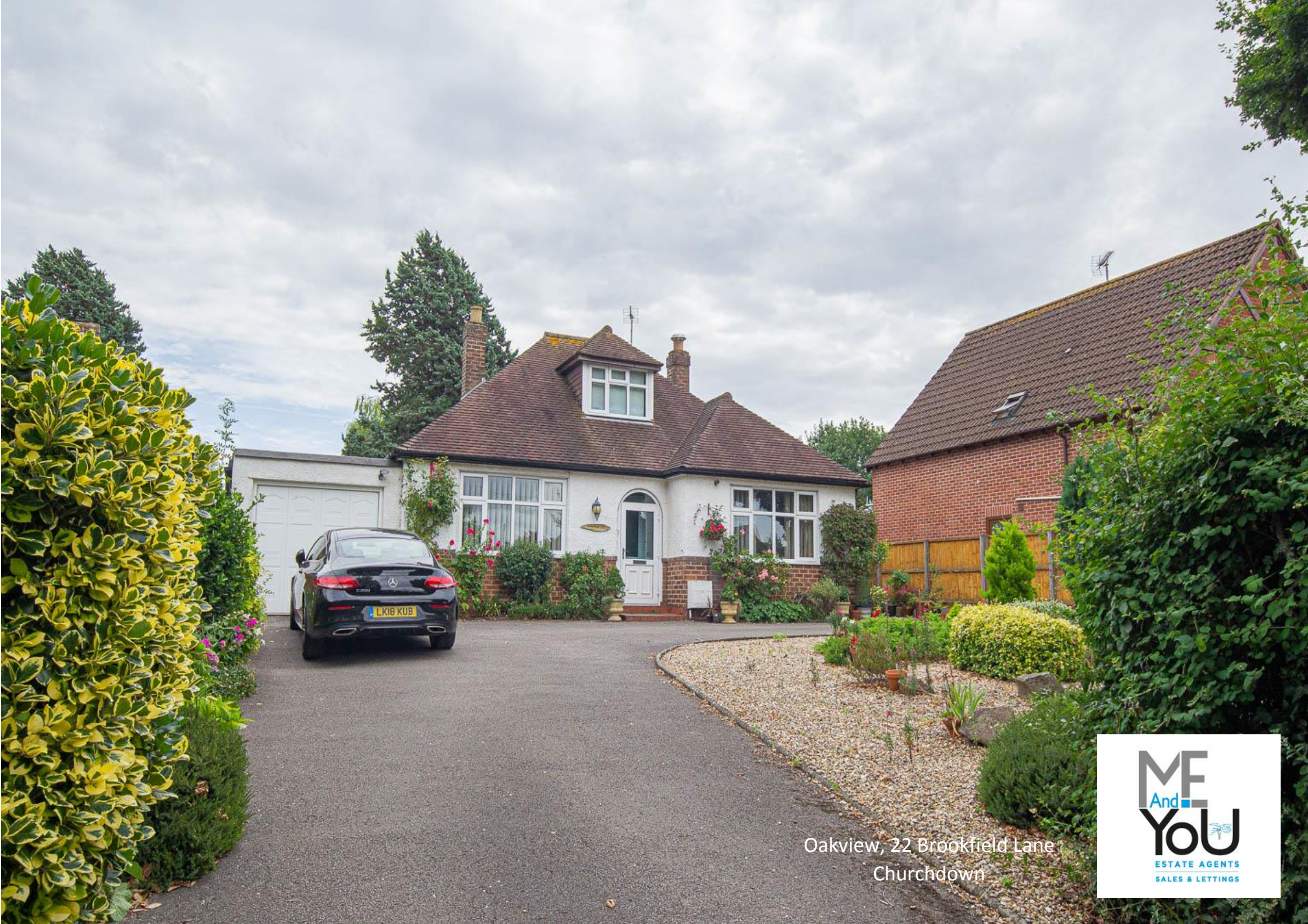
Oakview, 22 Brookfield Lane Churchdown