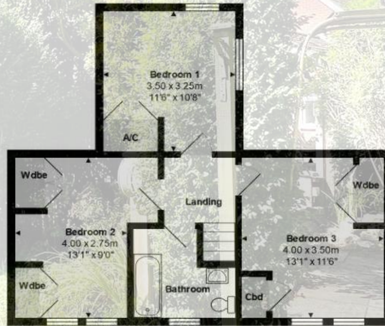
First Floor Area: 48.2 m 2 ... 519 ft 2 Heat-Loss Perimeter: 31.3m ... 103ft

Total Area: 131.4 m 2 ... 1414 ft 2 (excluding conservatory / garden room)