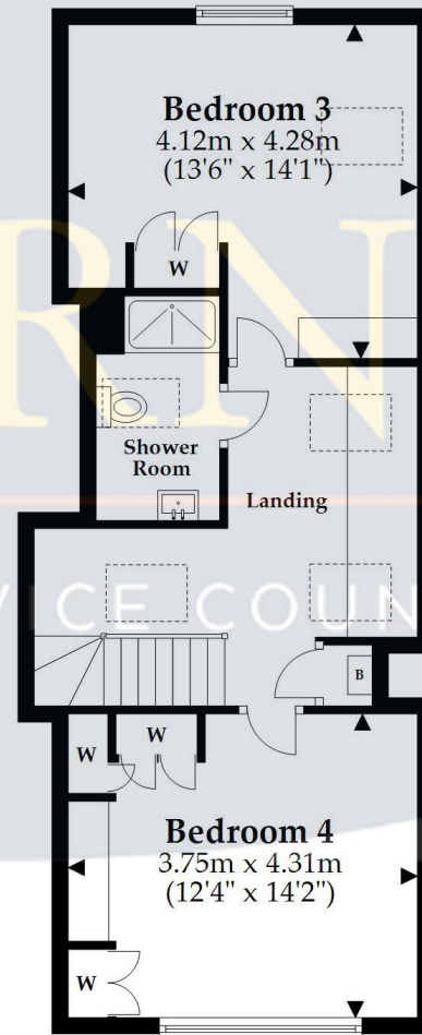
First Floor Approx. 52.1 sq. metres (561.3 sq. feet)