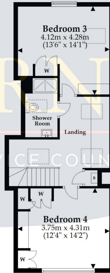
First Floor Approx. 52.1 sq. metres (561.3 sq. feet)