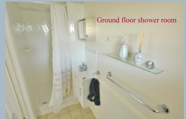
Ground floor shower room