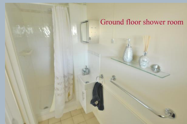
Ground floor shower room