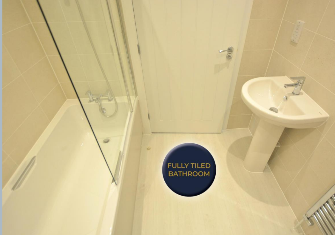
FULLY TILED BATHROOM