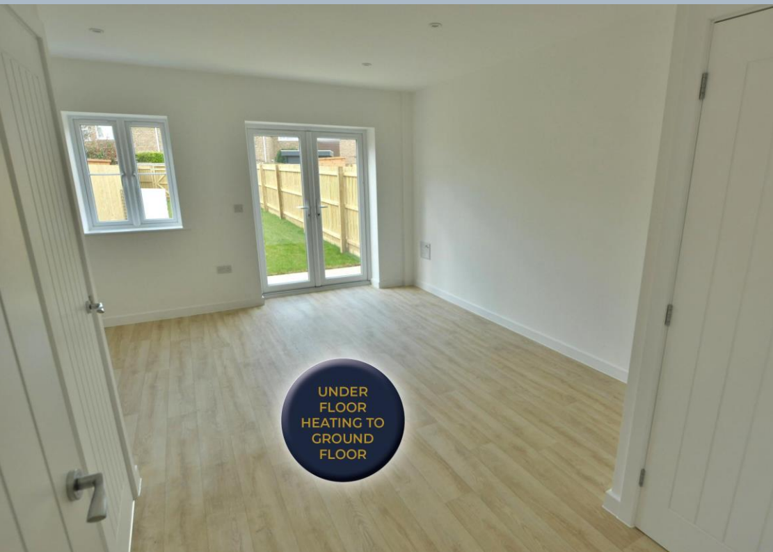
UNDER FLOOR HEATING TO GROUND FLOOR