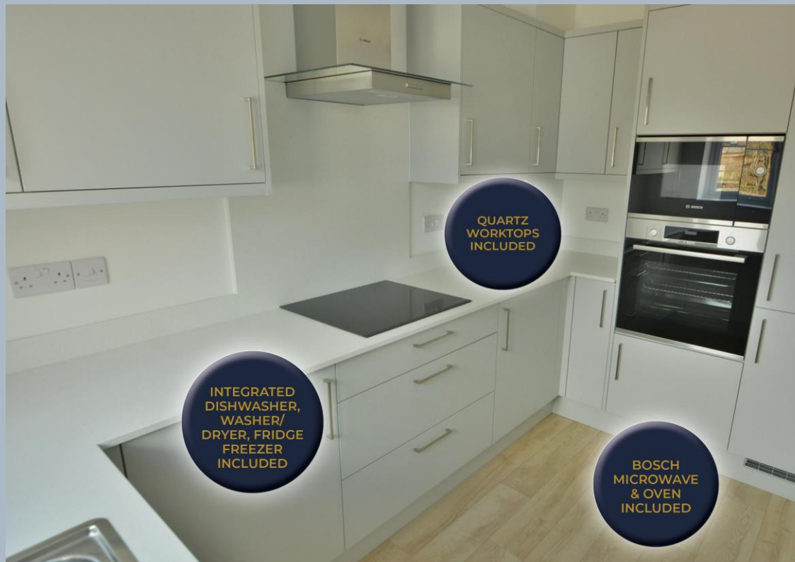
QUARTZ WORKTOPS INCLUDED