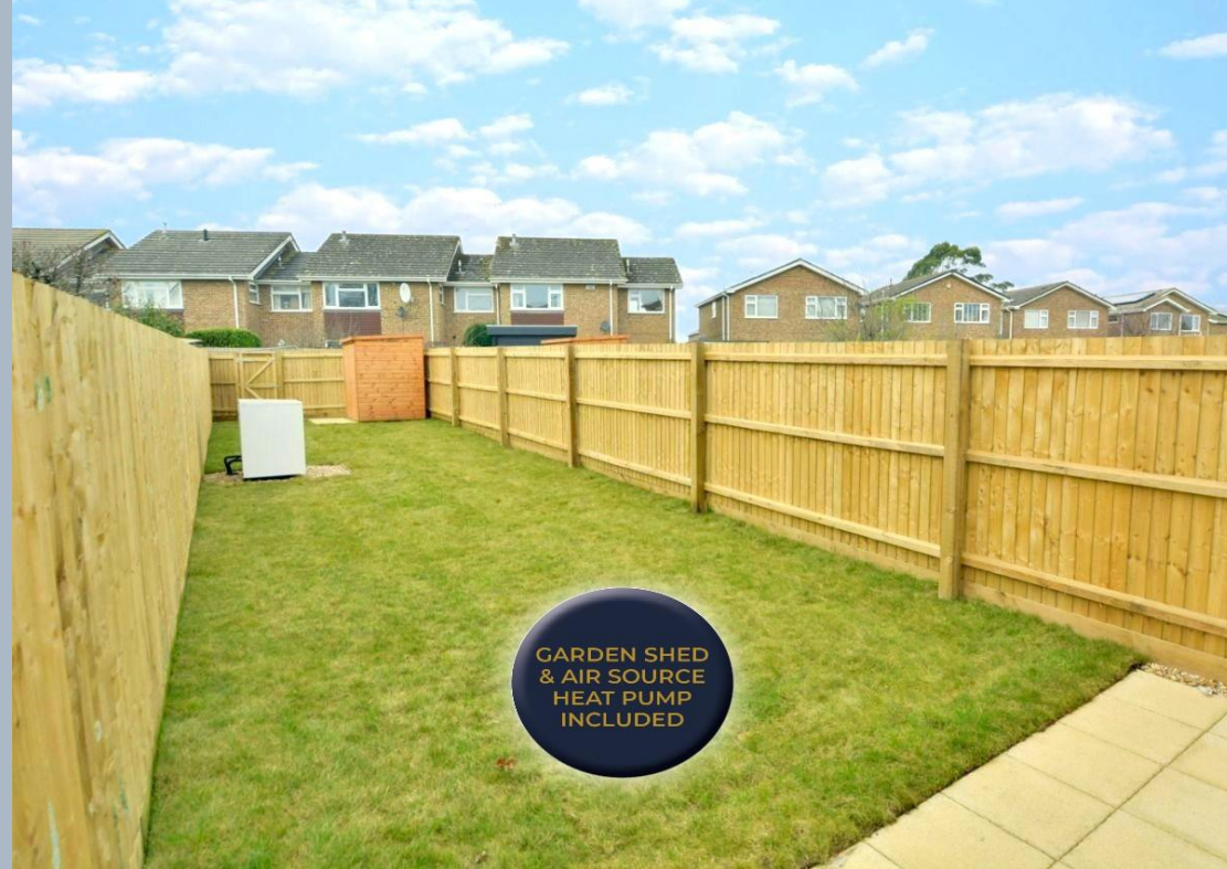
GARDEN SHED & AIR SOURCE HEAT PUMP INCLUDED