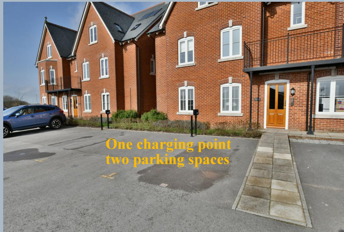
One charging point two parking spaces