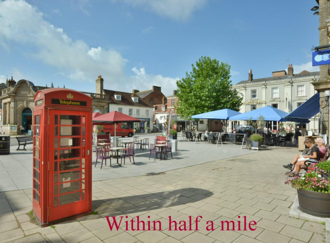
Within half a mile