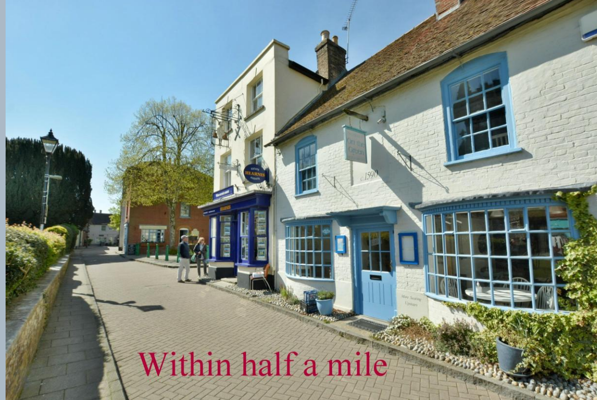
Within half a mile