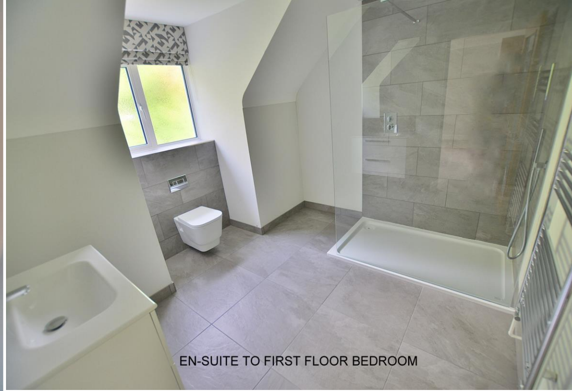
EN-SUITE TO FIRST FLOOR BEDROOM