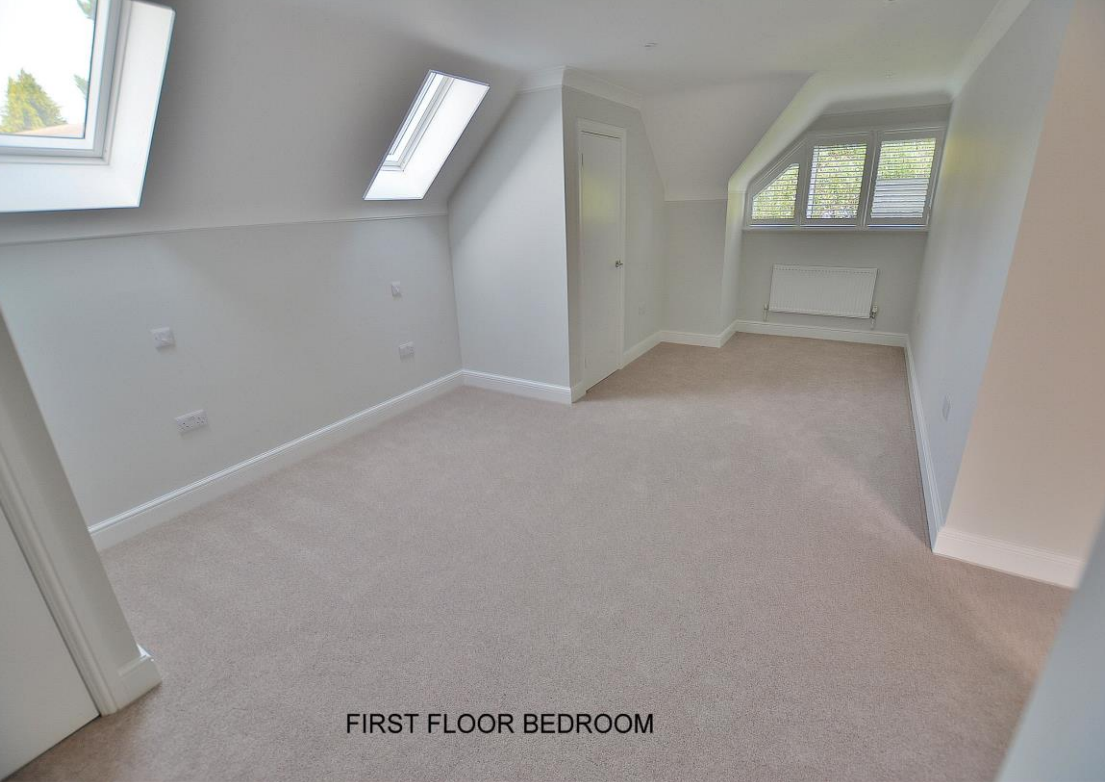
FIRST FLOOR BEDROOM