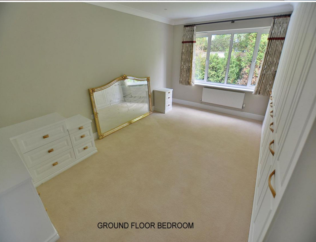
GROUND FLOOR BEDROOM