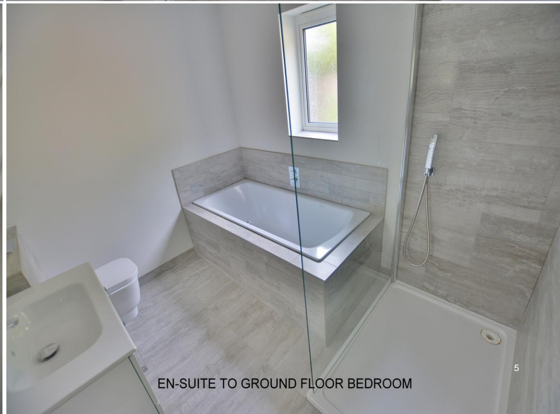
EN-SUITE TO GROUND FLOOR BEDROOM