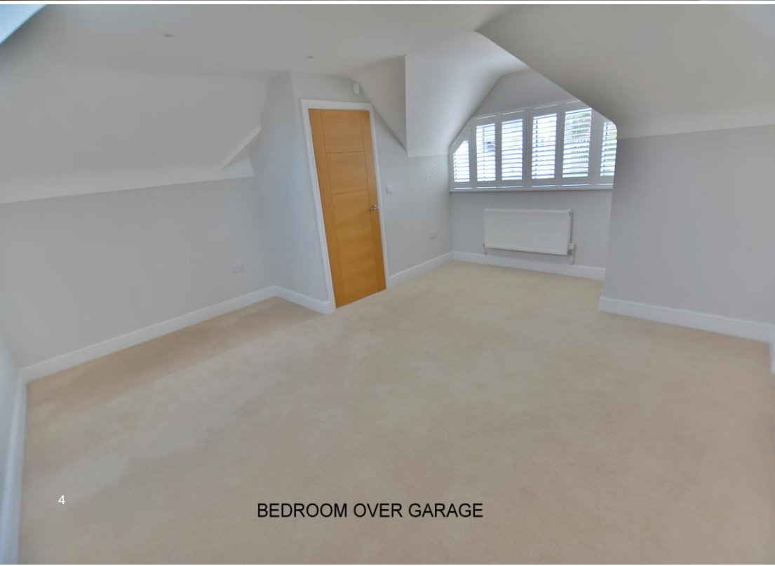
BEDROOM OVER GARAGE