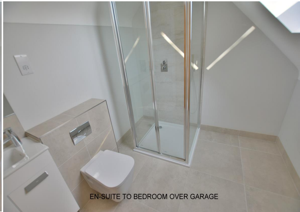
EN-SUITE TO BEDROOM OVER GARAGE