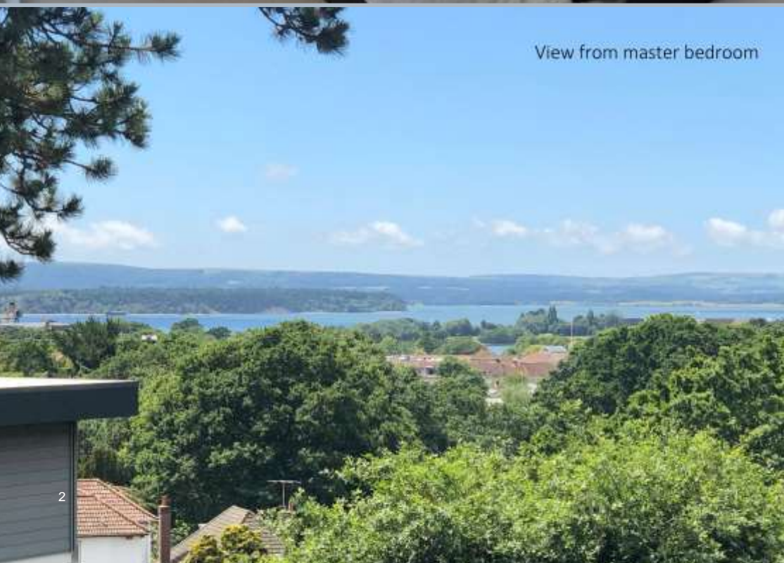
View from master bedroom