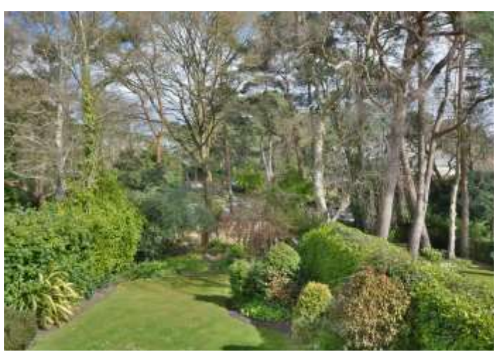
A beautiful Sylvan setting is one of the attractions of this lovely home which is ideally located for beaches, marinas and local shops, bars and restaurants in Canford Cliffs, Ashley Cross and Lilliput