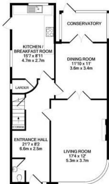
GROUND FLOOR APPROX. FLOOR AREA 724 SQ. FT. (67.2 SQ. M.)