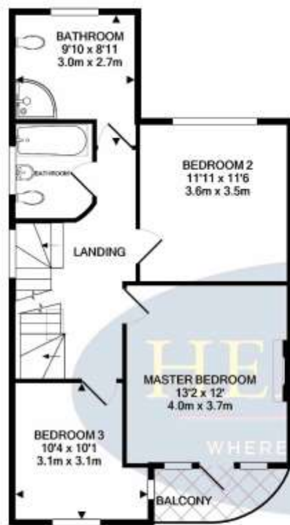
1ST FLOOR APPROX. FLOOR AREA 623 SQ. FT. (57.9 SQ. M.)