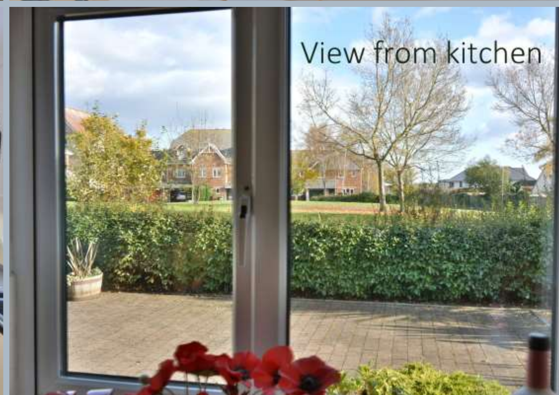
View from kitchen