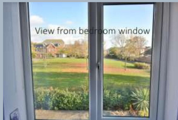
View from bedroom window