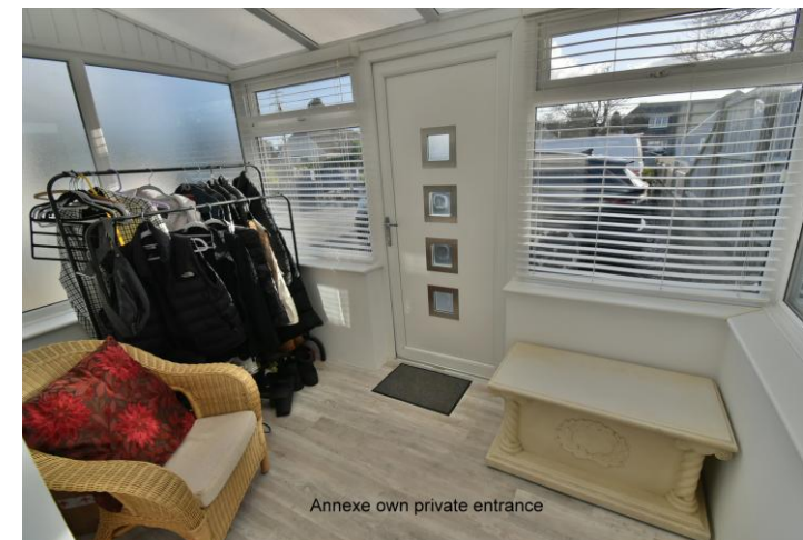
Annexe own private entrance