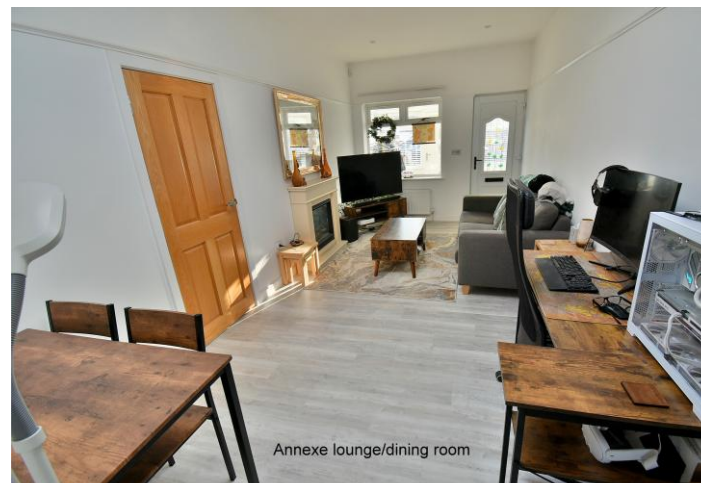
Annexe lounge/dining room