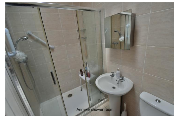
Annexe shower room