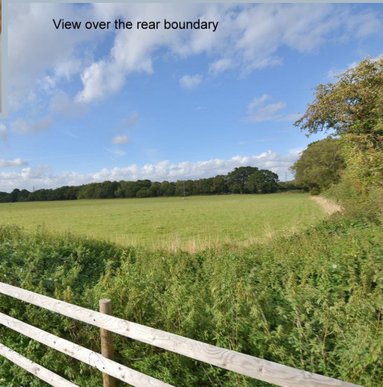
View over the rear boundary