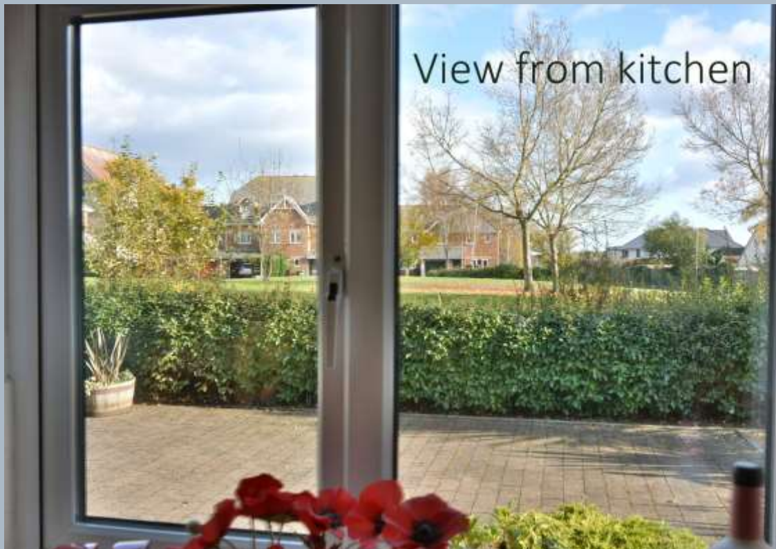
View from kitchen