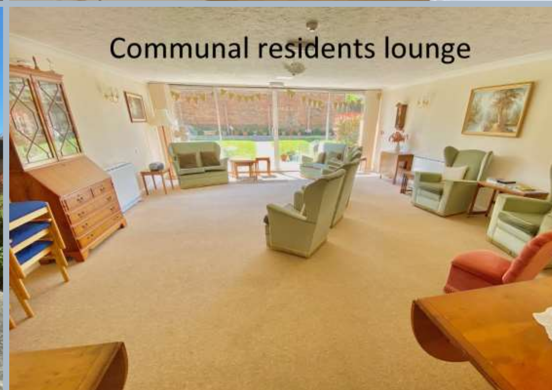
Communal residents lounge